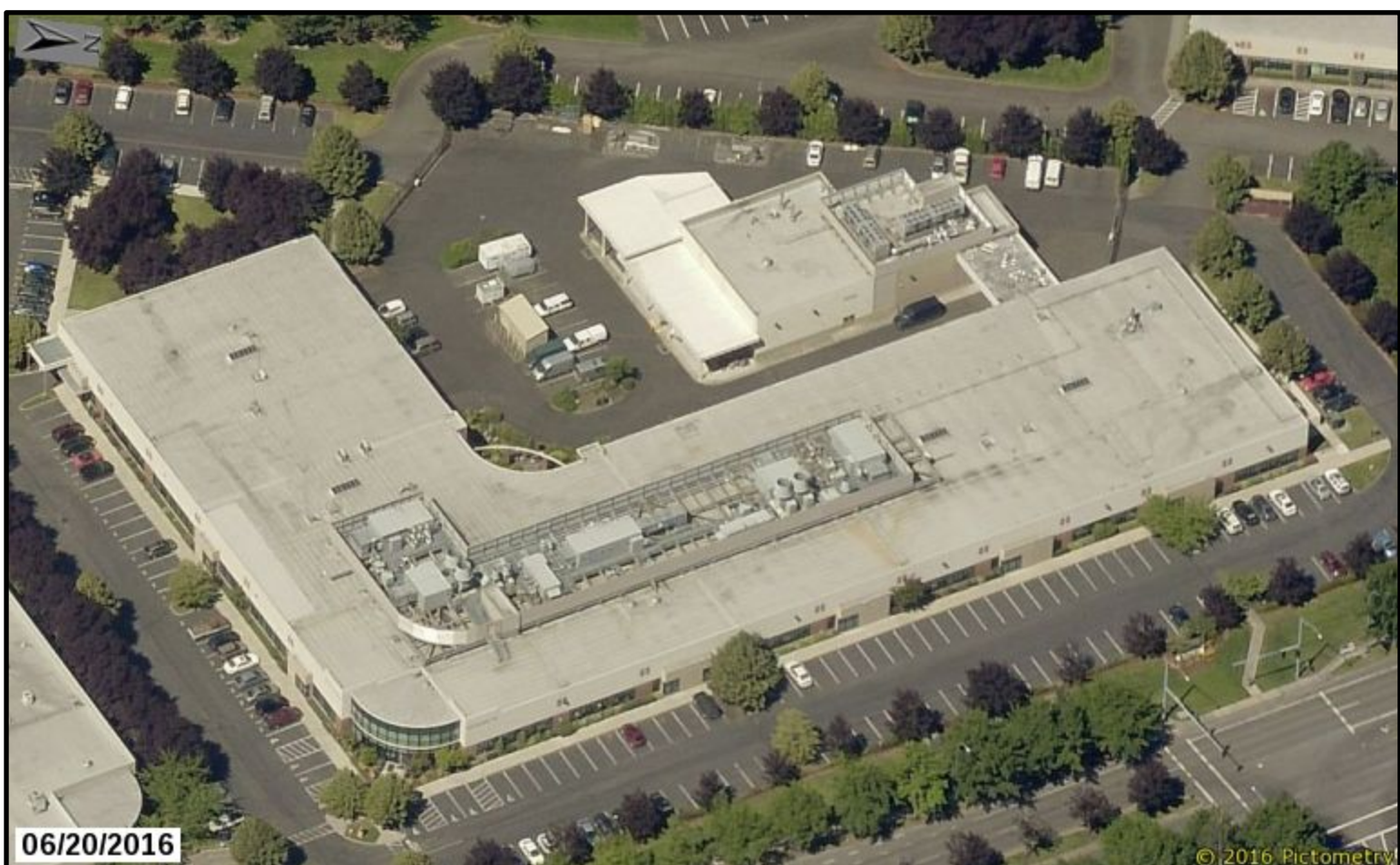
Pictometry Oblique View Facing West

Map Produced 2020 DAS EIS DGT Geospatial Enterprise Office gis.oregon.gov