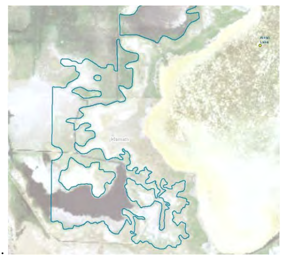
Figure 4 - Alkali Lake

placed on the island, such as in the example for Best Waterhole (Figure 3). For 20 of the lakes the GNIS label point fell within the lake and the GNIS ID and name were copied into the NHD. For another 20 lakes the feature appeared to be an extension of a waterbody with an assigned GNIS name (Figure 4).