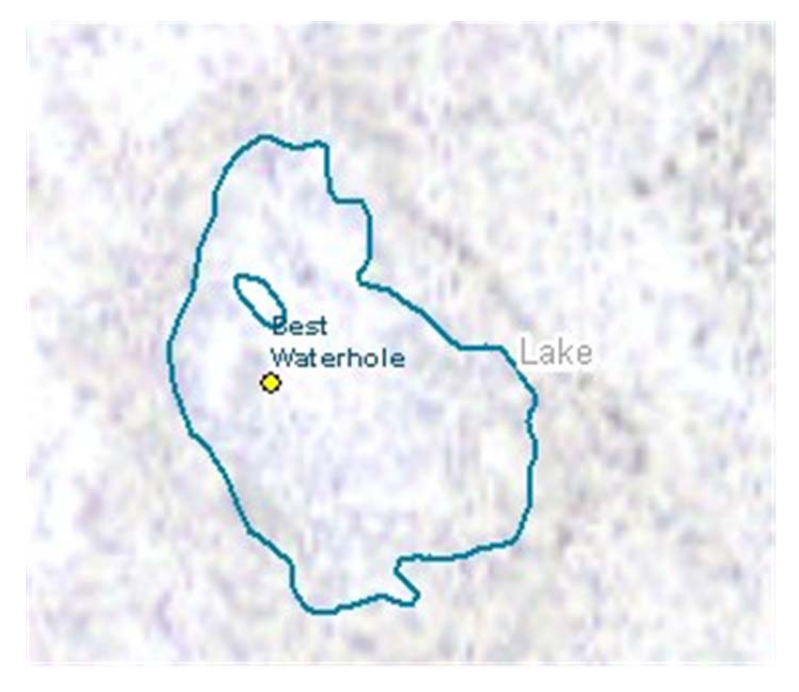
Figure 3 - Best Waterhole

In most cases the name was assigned by moving the label point inside of the waterbody polygon. Many of these moves were only for a short distance but some, such as for Crescent Lake, involved a longer move. There were a number of small arid lands reservoirs where a small island was digitized inside of the lake and the label point was